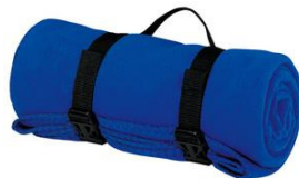
Fleece Throw, Royal, $19