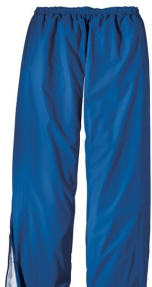
Nylon Sports Pants, Royal, $25-27