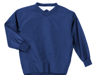
Nylon Windshirt, Royal, $23-25

Above items come embroidered with the Knights Logo